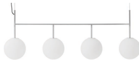
POLISHED STEEL, MATTE OPAL BULB 1465139