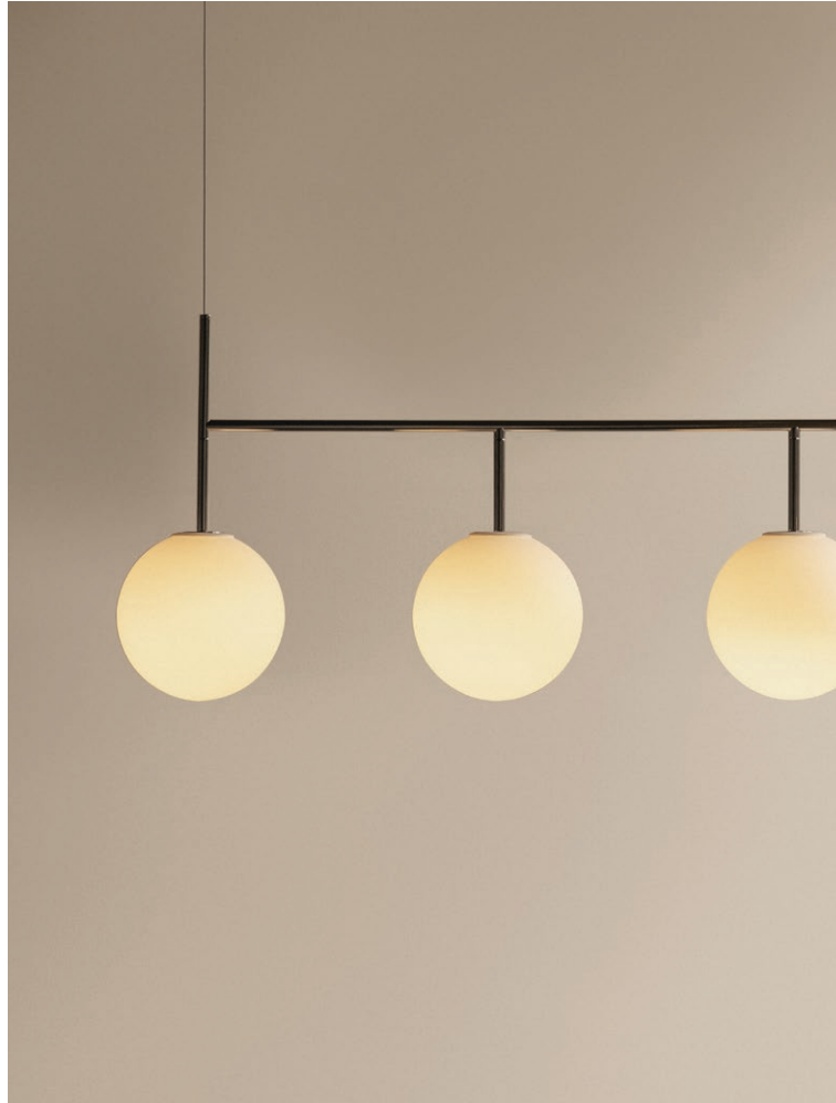
TR BULB SUSPENSION FRAME Designed by Tim Rundle